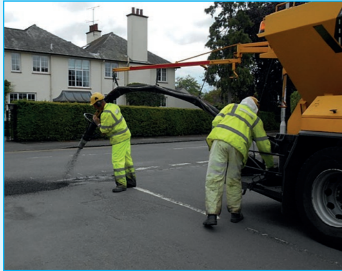
This Jetpatcher, seen in Bulstrode Way, repairs 10 to 15 holes an hour. The vehicle has a driver, a patcher, his assistant, and a traffic manager.