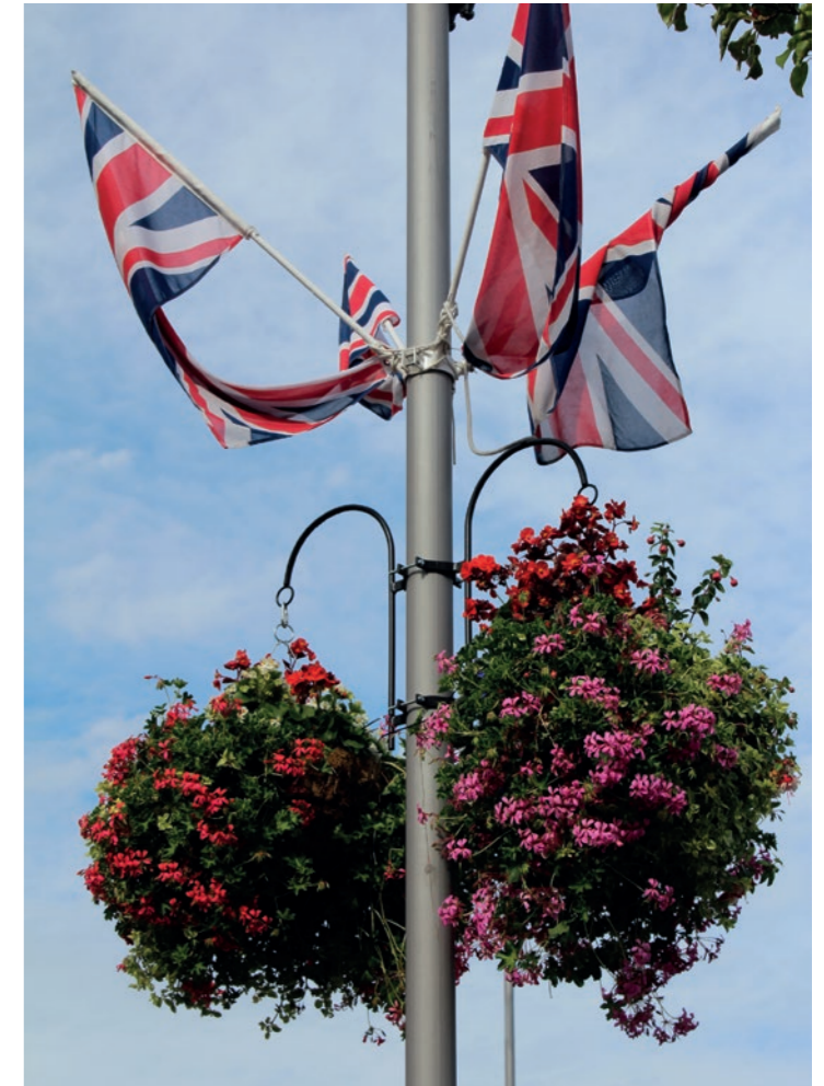
New hanging baskets brighten up Gerrards Cross town centre

The GXTA can be contacted on 01753 202210 or by emailing traders@gxtraders.co.uk